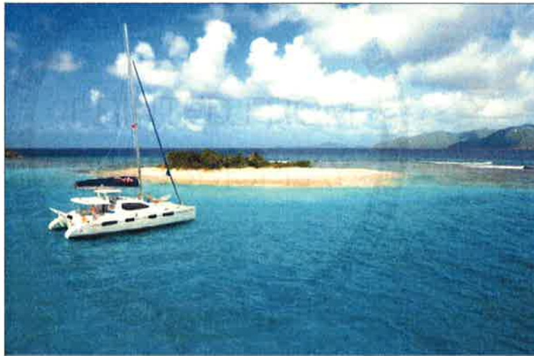
Catamaran is a great way to see the Abaco islands in the Bahamas.

While Captain Greg maneuvered in and out of ports we indulged in the aforementioned champagne sail